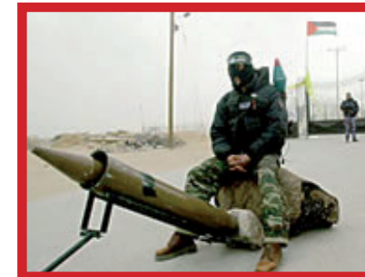
Jewish roulette? "I launch this indiscriminately to the Israeli side and hope I kill somebody."