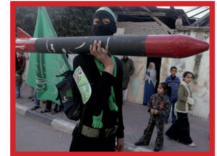
Gaza- Kassam carrying terrorist parading in front of children (just ask the UN: this is not a war crime!)